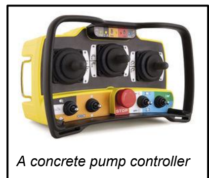
A concrete pump controller

As you can see, along with the renovation of Gresham High School, the new school will make learning up through the grades a better experience for all!